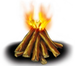
Indian Teepee Fire

1. Indian Teepee Fire: Begin this fire by placing one or two handfuls of tinder in the very center spot for your fire. With the “kindling” sticks you have now gathered, form sticks (with a small portion sticking into the ground) as if you are making a small teepee. The sticks come together at the top, as they lean into each other. Keep it in close so that the tinder will burn the teepee sticks quickly. Once these flare up, add larger sticks until a good flame is going, then you are ready to lay larger wood flat on the fire.